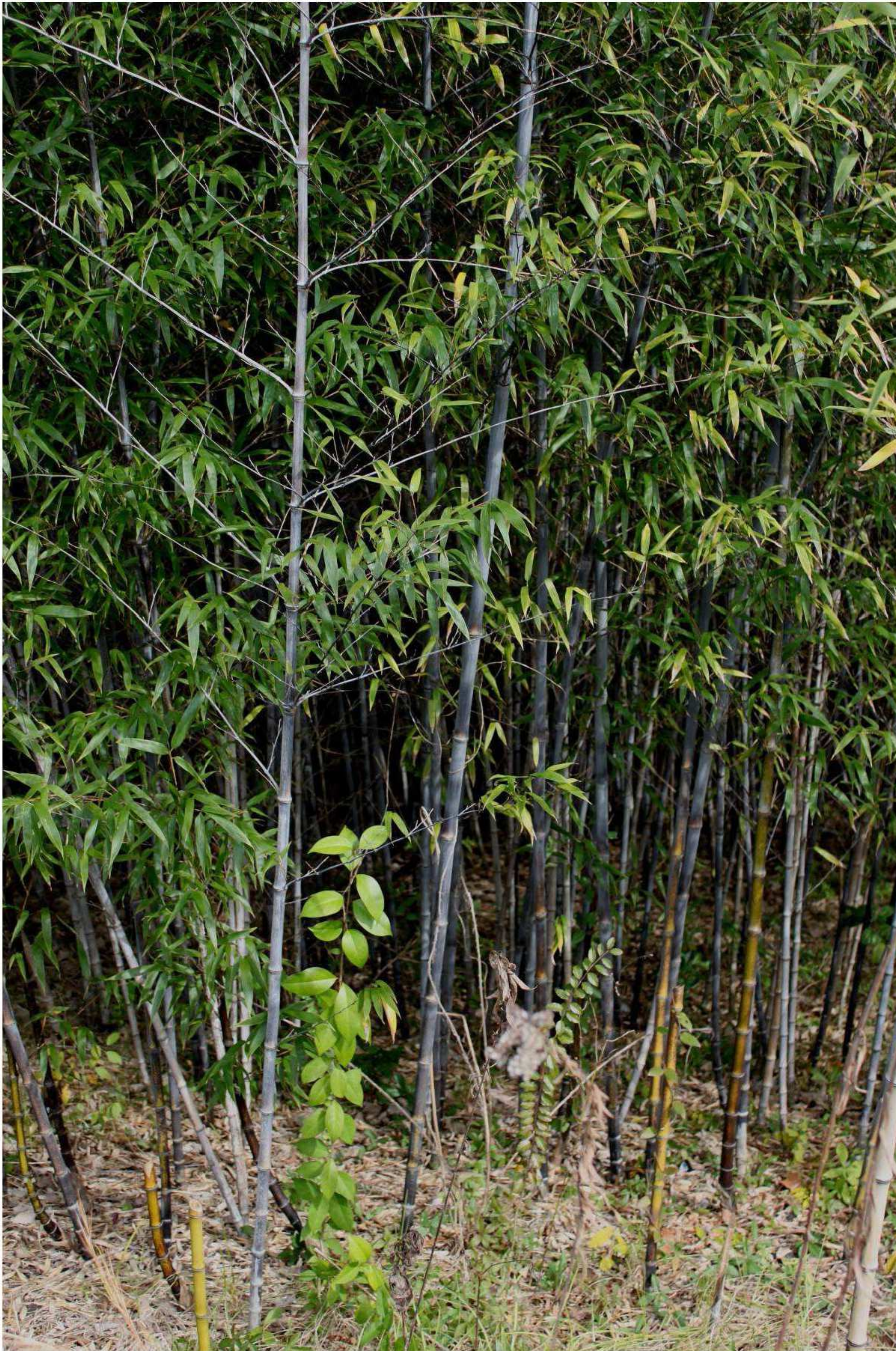
Figure 8. Phyllostachys nigra var. nigra (Poaceae).